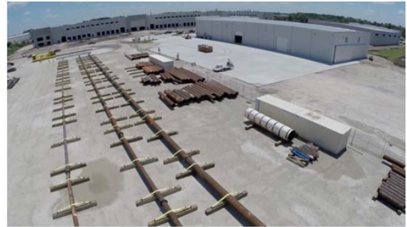
State-of-the-art pull test facility with 24, 16 and 12 inch pull test strings.